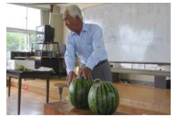
Meeting to hear the passion of making watermelon and history of the Tenpaku from elderly people in the region

(3) Activities that touch the people and history of the area